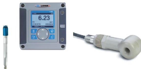
Controllers and sensors for online analysis