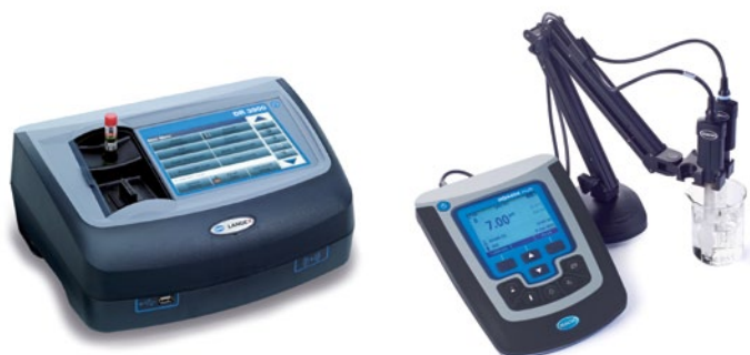
Benchtop and portable instruments for lab analysis, with special tests for plating baths. Inspection, maintenance and equipment qualification services available

* For additional parameters and solutions please contact your local HACH LANGE representative or visit our website.