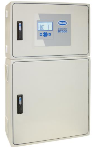
Figure 2. BioTector B7000.

“BioTector has an excellent maintenance record at the Schkopau site” commented Mr. Bach. The analyzers require mostly routine six month services and monthly reagent change. Calibration is checked