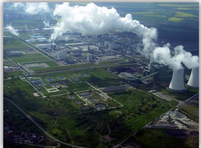
Figure 1. Aerial shot of the DOW Schkopau site, courtesy of Mr. Steffen Bach.

A BioTector B7000 customer for 2 decades and located in eastern Germany, the DOW Schkopau site has 4 Hach BioTector analyzers which were originally installed in 1999 and upgraded in 2013.